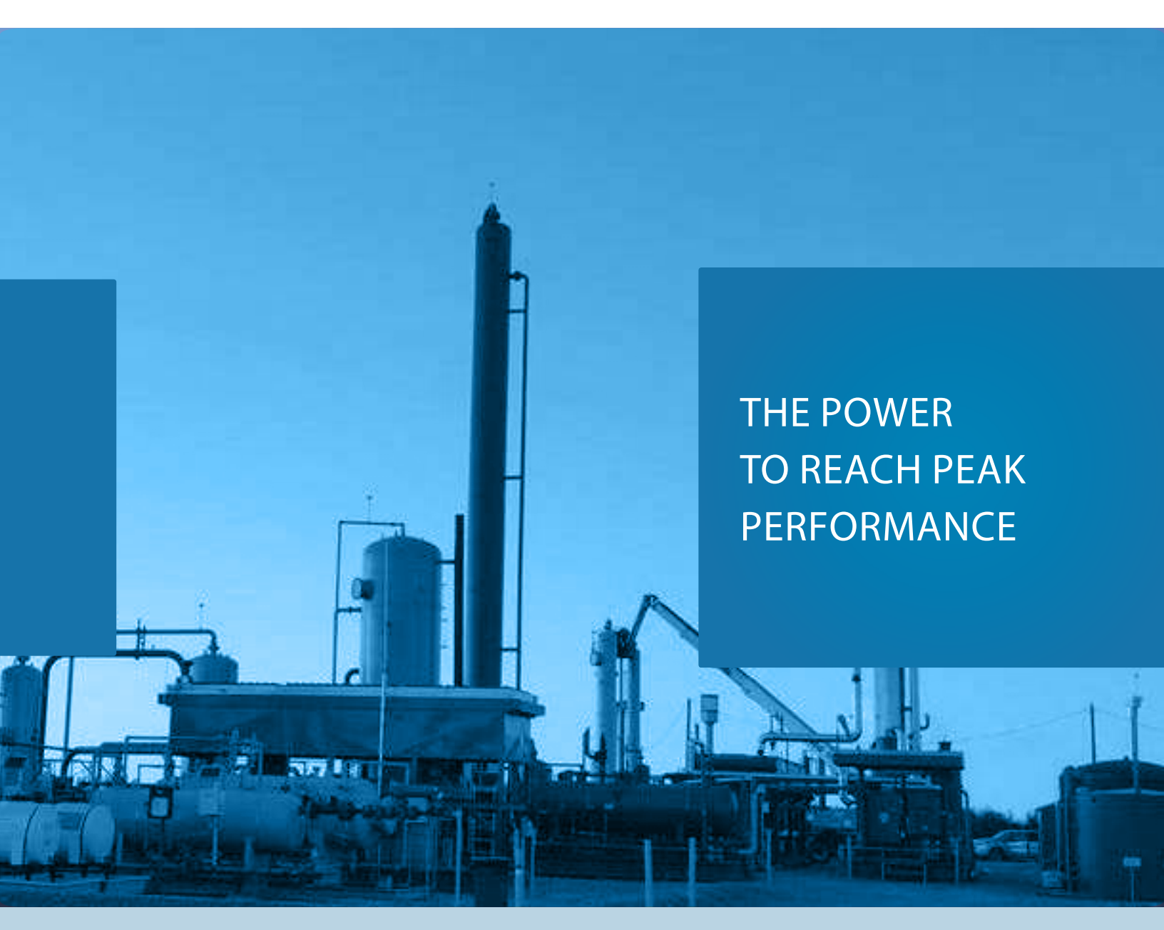
Design, Service, Sales and Installation of Production, Measurement, Automation and Controls Systems